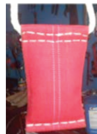
Monkey fist made of old fire hose filled with sand

The vessel and company were advised and there was an internal investigation. The vessel had five other heaving lines with monkey fists on inventory. After testing with a metal detector no metal parts were found and all weighed less than 500g, which is an accepted maximum limit according to best practice and certain codes. It would appear a crewmember had made the monkey fist on his own initiative, and this escaped supervision or detection.