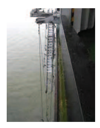
The damaged telescopic accommodation ladder from which a seaman fell to his death when the hoist winch failed

accommodation ladder. The failure of the gearbox caused the lower telescopic section of the ladder to descend uncontrollably. When the ladder reached the end of its travel the bolts holding the rollers sheared and the lower section fell into the water. At the time of the failure the seaman was standing on the lower section rigging stanchions and fell overboard. He was not wearing a fall prevention device or a lifejacket. It was subsequently found that the gearbox had been incorrectly re-assembled following maintenance by the ship's crew.