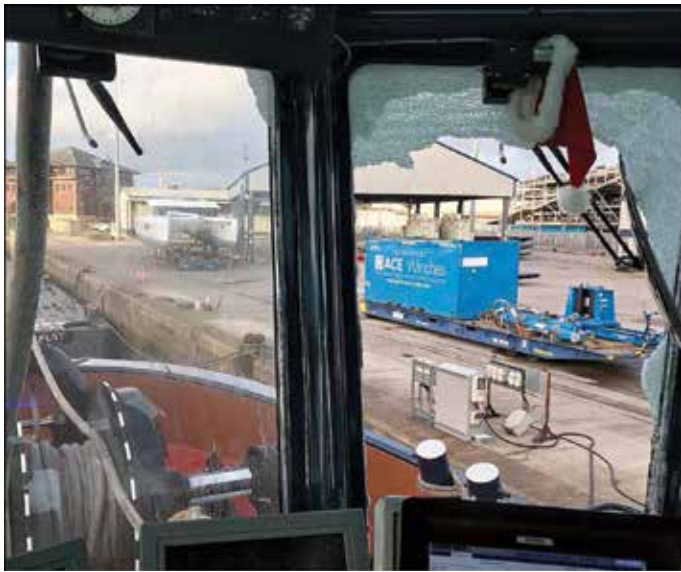
Shattered wheelhouse window

Five crew in the wheelhouse of tug A were struck by flying glass fragments and suffered multiple minor facial, arm and upper body lacerations, including both Masters. All of the crew were wearing some form of eyewear, which prevented any eye injuries. The rest of the wheelhouse was riddled with glass fragments. Two of the inner panes of the aft-facing windows were also cracked but did not break.