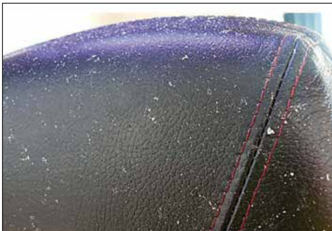
Glass fragments embedded into chair

The mate from the delivery crew took control of the tug while the delivery Master went below to clean blood from his face. When the delivery Master returned to the wheelhouse, he resumed control, and shortly afterwards agreed with the container vessel's pilot that tug A would swap places with tug C. After repositioning the tugs, the container vessel safely berthed and the tugs were released.