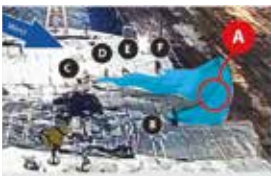
Several strong gusts of wind force person A under the tarpaulin and push him close to the edge

Person A, who was moving aft along the edge of the deck, was caught in the tarpaulin, which then caught the wind and acted as a sail. The other crew present were likewise unable to withstand the forces that acted on the tarpaulin. As a result, person A was pushed over the edge of the deck and fell to the dock. The crew immediately administered first aid to the victim until port rescue personnel arrived. The victim was transported to hospital by helicopter but was declared deceased the next day from injuries sustained.