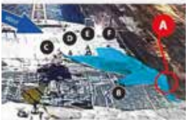
Person A is pushed over the ship's side and falls to the dock