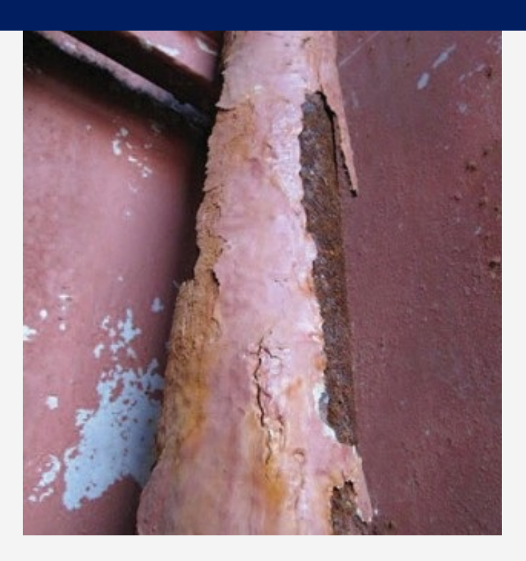
Hold components and pipework heavily corroded.

Fixed hold air sampling fire detection systems and fixed CO2 systems should be periodically blown through with compressed air when the holds are free of cargo as a routine task included in the planned maintenance system, so that any debris is blown out and the pipes remain clear for their intended purpose and debris cannot migrate into the hold.