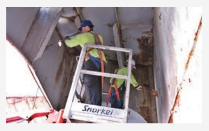
Cherry pickers for access to the upper reaches of the hold.