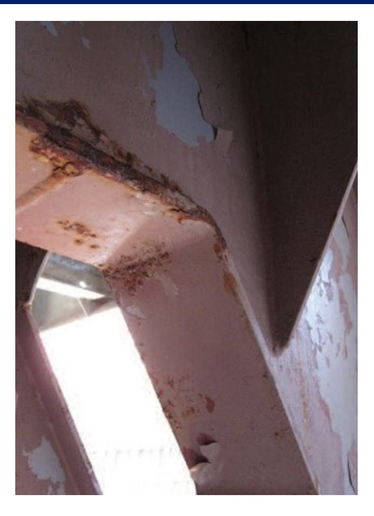
Flaking of paint coatings.

In general terms holds should be cleaned so that there are no residues of previous cargoes, no loose rust scale, paint flakes or blistering of paint coatings, no evidence of insect or rodent infestation when foodstuffs are to be carried and no odours present, including those from cleaning chemicals and paint. Holds should be thoroughly dried prior to loading though some cargoes may be loaded damp from open stockpiles possibly negating this requirement.