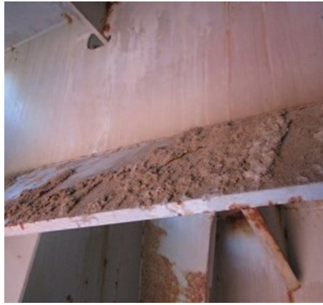
Cargo residues remaining on the framework