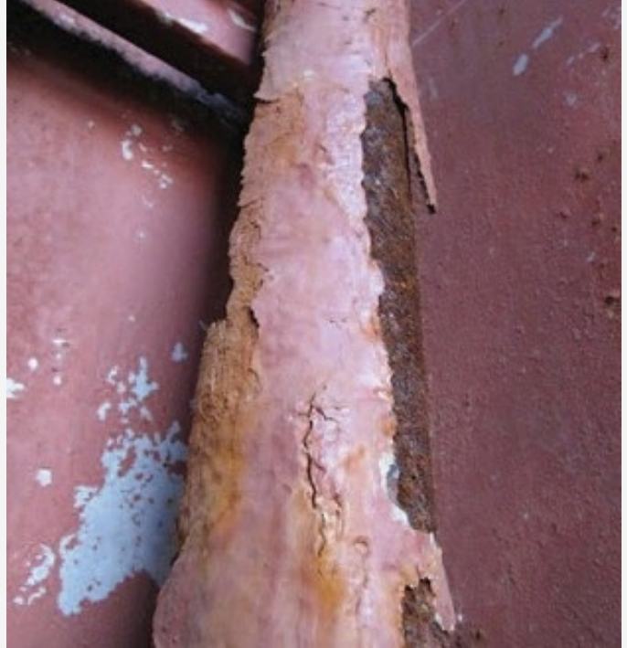
Hold components and pipework heavily corroded.

Fixed hold air sampling fire detection systems and fixed CO2 systems should be periodically blown through with compressed air when the holds are free of cargo as a routine task included in the planned maintenance system, so that any debris is blown out and the pipes remain clear for their intended purpose and debris cannot migrate into the hold.