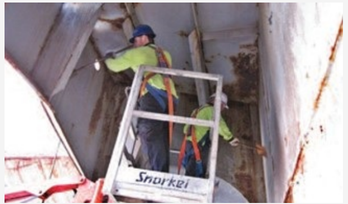
Cherry pickers for access to the upper reaches of the hold.