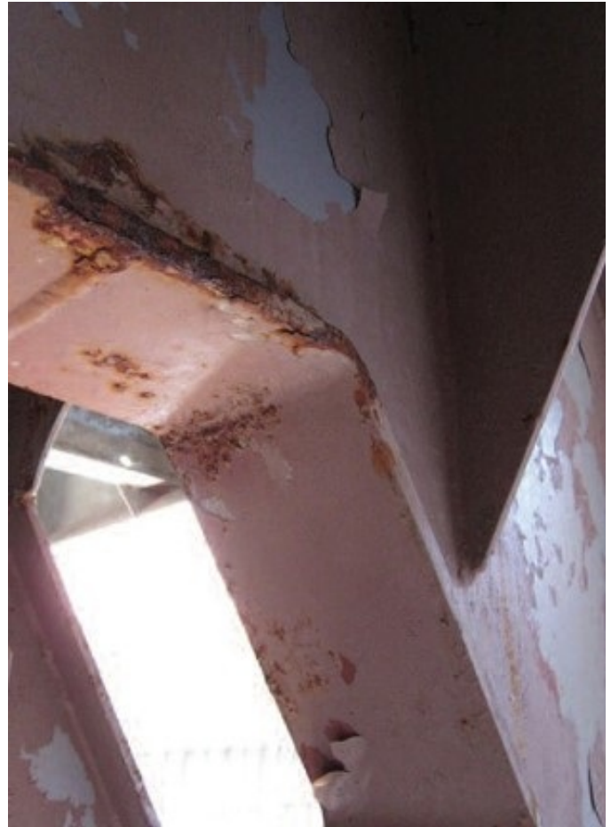
Flaking of paint coatings.

In general terms holds should be cleaned so that there are no residues of previous cargoes, no loose rust scale, paint flakes or blistering of paint coatings, no evidence of insect or rodent infestation when foodstuffs are to be carried and no odours present, including those from cleaning chemicals and paint. Holds should be thoroughly dried prior to loading though some cargoes may be loaded damp from open stockpiles possibly negating this requirement.