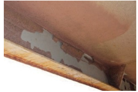
Flaking of paint coatings.