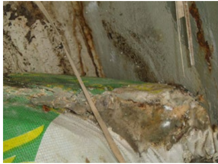
Bagged Rice damaged as a result of ship sweat when in contact with Shell Plating in a Cargo Hold

For hygroscopic cargoes a checklist detailing the steps and measures to be taken prior to and during loading, and whilst on passage, may be used.