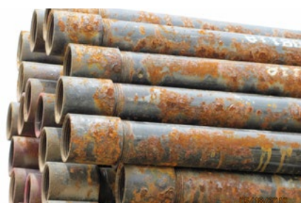
Steel Pipes corroded as a result of Cargo Sweat